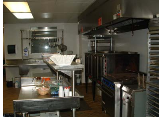
Photo of comparable kitchen

Adjacent to the kitchen will be a 450 square foot café. This area will contain booths, tables, and vending machines. It will be a place where teenagers can gather to talk, parents can drink coffee while their children are involved in drama rehearsals, or refreshments can be served during Upward Basketball games. We envision youth staffing the café and selling refreshments, with the proceeds going to fund youth mission trips and other endeavors.