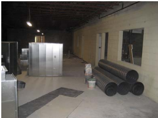
Café under construction

Adjacent to the kitchen will be a 450 square foot café. This area will contain booths, tables, and vending machines. It will be a place where teenagers can gather to talk, parents can drink coffee while their children are involved in drama rehearsals, or refreshments can be served during Upward Basketball games. We envision youth staffing the café and selling refreshments, with the proceeds going to fund youth mission trips and other endeavors.