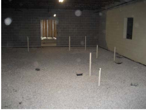
Kitchen under construction

Our new kitchen will be located adjacent to the gymnasium/multipurpose room. Our current kitchen appliances are over 25 years old and need to be replaced. The new kitchen will provide a new serving area, pantry, refrigerator, freezer and other appliances.